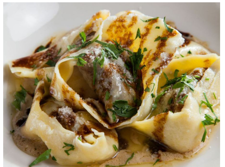
This poetic dish is called Tortelloni Roasted Beef Short Rib, Foie Gras Emulsion & Marsala.