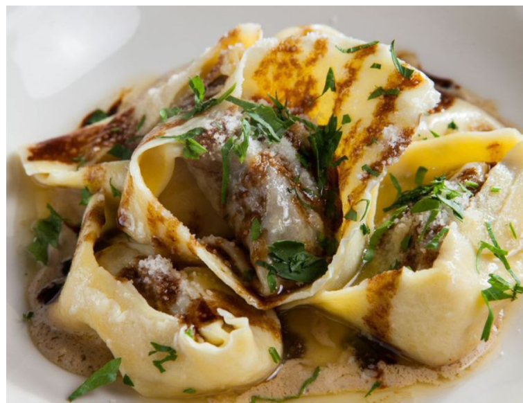
This poetic dish is called Tortelloni Roasted Beef Short Rib, Foie Gras Emulsion & Marsala.